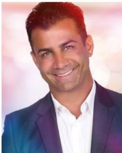
Figure 7 Source: Schumer Lizz, Coming Out Is a Journey: 20 LGBTQ+ People Share Their Stories , goodhousekeeping.com , 2021

“When I was growing up as an Armenian kid living in Iran, I always knew something was different about me, but I didn't dare say it out loud. I was attracted to other boys. People definitely had their suspicions; I was generally less soccer and more dance. I was teased and bullied throughout my childhood, and I could never let my guard down, even at home. Let's say my ultra-conservative Middle Eastern parents weren't exactly in the running for any PFLAG awards. Iran is not accepting of LGBTQ people, and it's very dangerous to be gay in Iran. But as they say, a mother always knows,