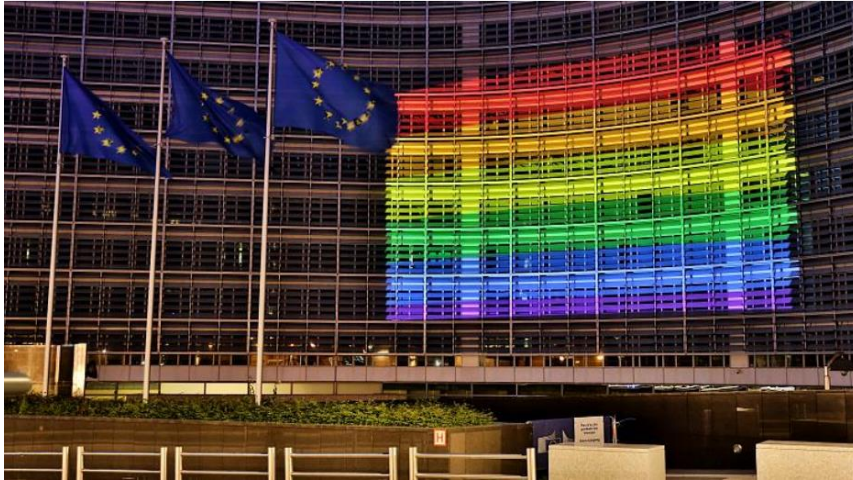
Figure 6 The building of the European Commission lit up with the Rainbow flag, supporting the LGBTQ community.

In several European countries, hashtags such as #homophobia, #May 17 and #IDAHOTB were trending on Sunday.