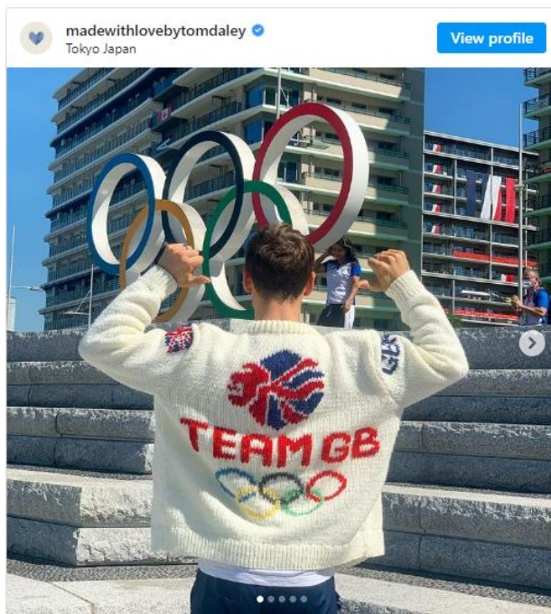
Figure 3 Daley proudly showing a knitted jacket he knitted for the Tokyo Olympic Games 2020.

"When I say I'm obsessed with knitting, I was knitting on the way, on the bus to the pool, on the bus home from the pool, in the stands, whenever I had a spare moment.