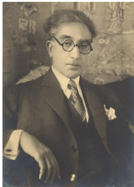
Figure 12 Cavafy in his 50s.