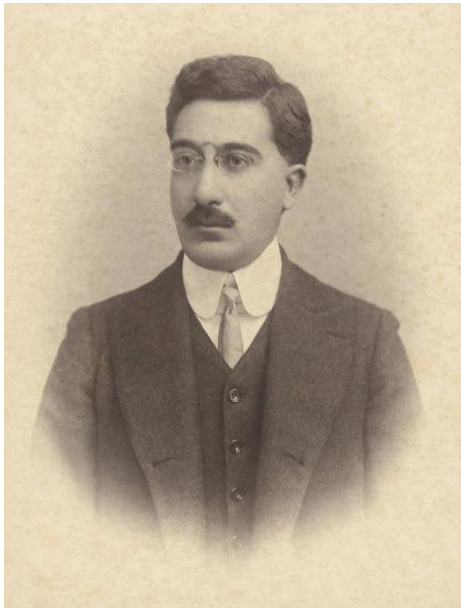
Figure 13 Cavafy at a young age.