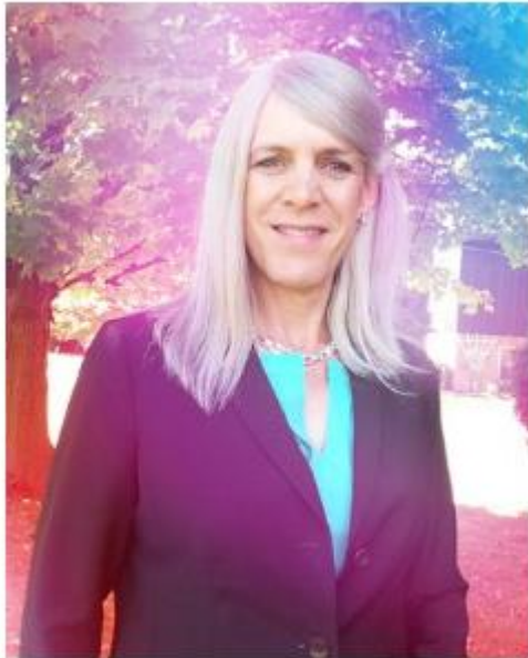
Figure 9 Source: Schumer Lizz, Coming Out Is a Journey: 20 LGBTQ+ People Share Their Stories , goodhousekeeping.com , 2021

My mother's response was particularly interesting. She asked me, "Why would you give up your male privilege?" Knowing some of the challenges my mother has encountered as a woman based solely on the basis of her gender, I have come to appreciate that remark, especially having inherited some of those characteristics. Over the next few years, I slowly came out to friends, colleagues, associates and strangers. Each time I met someone new and I get to know them, I have to decide if they are worthy of knowing the truth. If I decide they are, I come out to them as well. Now, at age 58, I actively advocate for policies, and practices that create a more welcoming environment for LGBTQI+, women, and other underrepresented groups. My personal experience can prove that businesses, organizations, communities, and our nation can be stronger and better when we create inclusive spaces so each person can be the best of who they are.