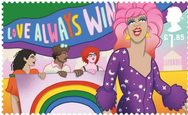
Figure 5

Throughout the 1990s, Pride spread across the UK. Pride Scotia launched in Scotland, with annual marches alternating between Edinburgh and Glasgow, and the first Cardiff Pride followed in 1999. In the 2000s, attendance at Pride in London grew alongside increasing support for LGBTQ+ rights, and more events were launched under the Pride banner. By 2015 Pride in London was attracting 1 million people, and it continued to grow until the Covid pandemic forced cancellations in 2020 and 2021.