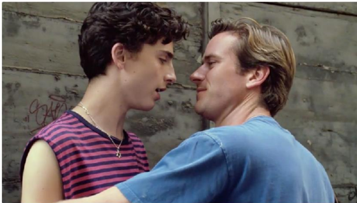
Figure 11 Photo from the film, the tension and attraction are gradually building up

They both use their sexuality as a means of self-expression while trying to get each other's attention. Elio is sexually involved with her friend Marzia while Oliver openly flirts with Chiara. While this film tells the story of a homosexual romance, it isn't explicitly a homosexual movie. The two protagonists "could more accurately be described as bisexual or pansexual, attracted to men and women alike" 38 . Therefore, this film does not explicitly refer to the LGBTQ+ community and it portrays a